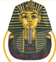
Tutankhamun's death mask